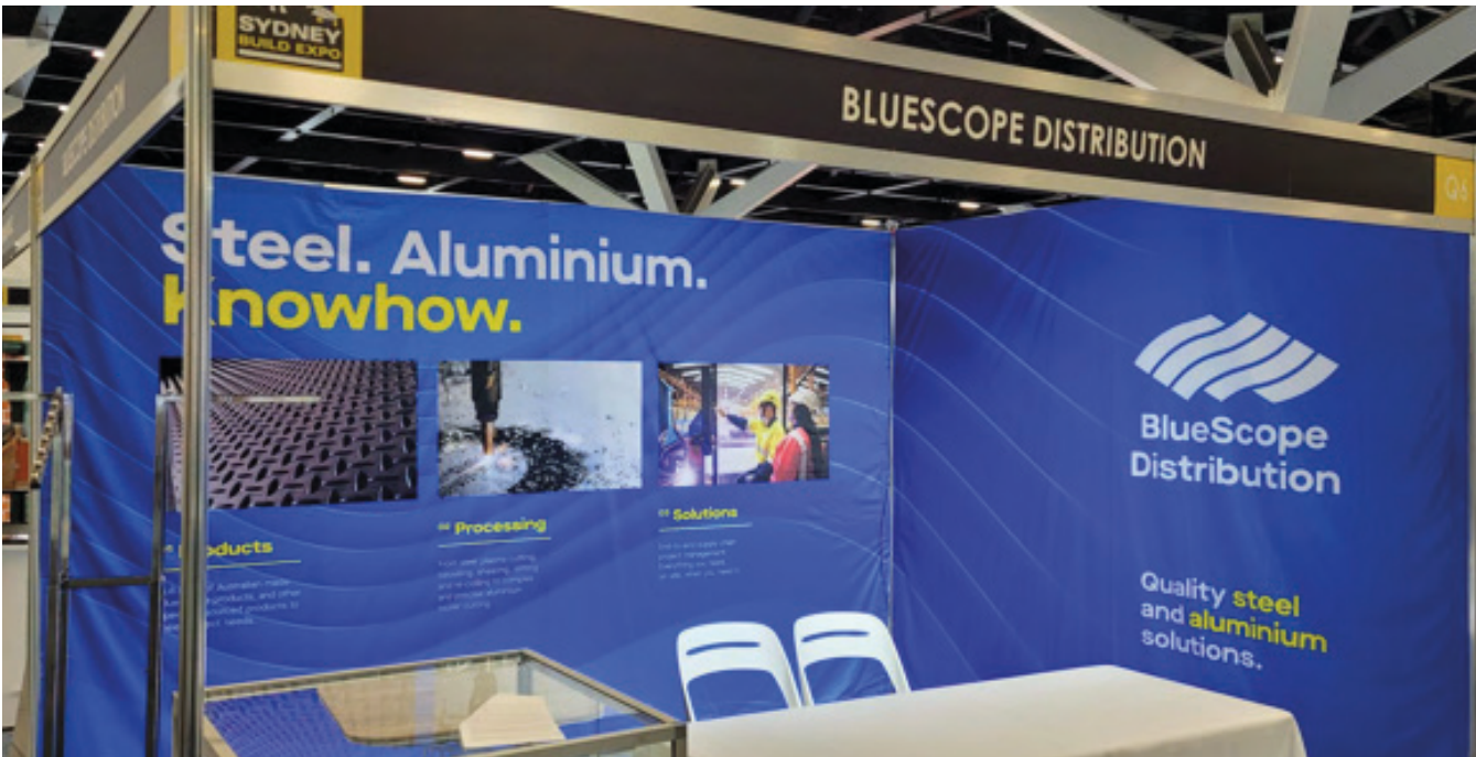
Fabric backdrop banner with Velcro edging for application