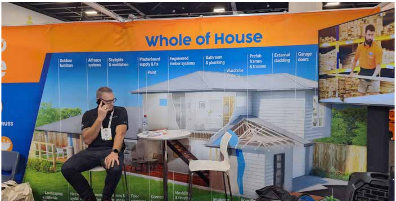
Fabric backdrop banner with Velcro edging for application