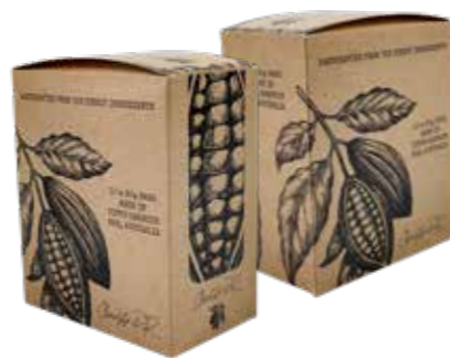
SRPs – Shelf ready Packaging